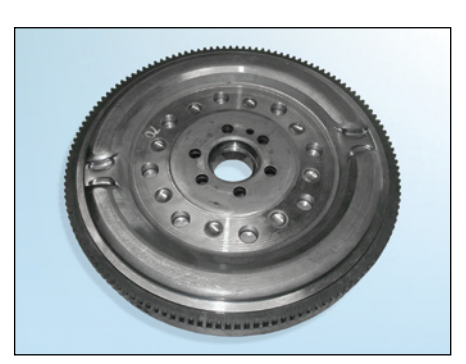
Figure 4: Sachs-DMF

It is even simpler when you use the DMF RepSet (item no.: 600 0015 00), which is supplied with all the components you need to professionally replace the DMF and the clutch.