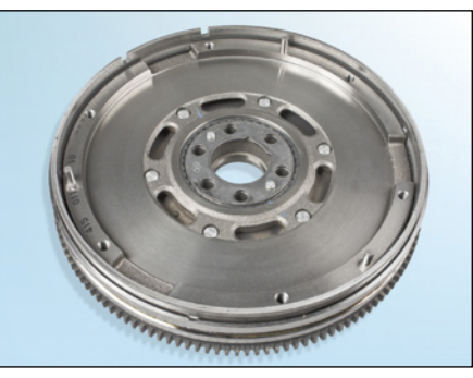
Figure 1: LuK-DMF

Item no: 415 0231 10 (DMF) 623 3092 00 (RepSet) 623 3092 10 (RepSet) 600 0015 00 (RepSet DMF)