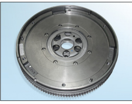
Figure 3: Sachs-DMF