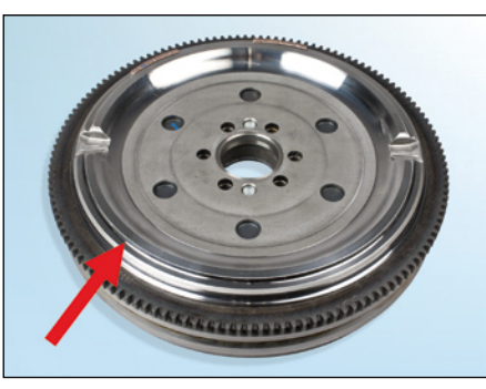
Figure 2: LuK-DMF

If a repair involving the flywheel is required, a retrofit replacing the Sachs version with a LuK version can be carried out.